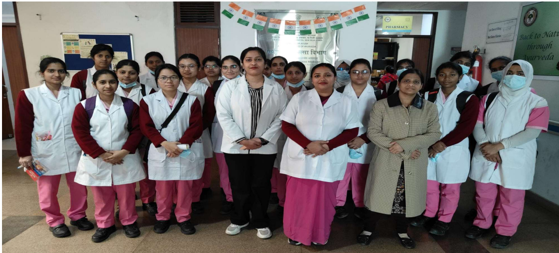
Educational visit of students of Rajkumari Amrit Kaur College of Nursing