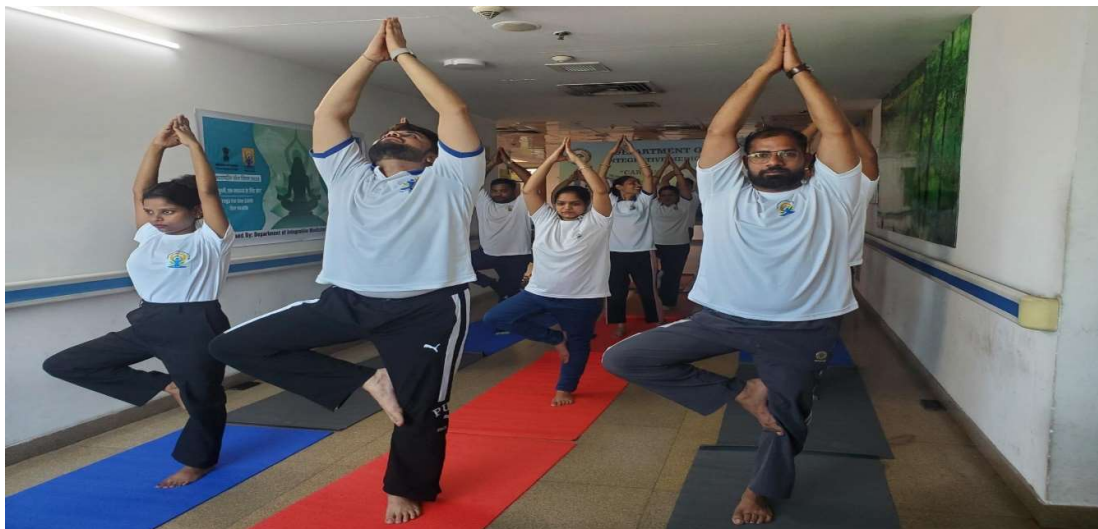
11th International Yoga Day Celebration at Department of Integrative Medicine