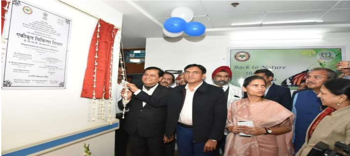
Inauguration of Department of Integrative Medicine